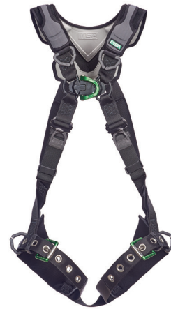
V-FLEX Standard Full-Body Harness w/Front D-Ring